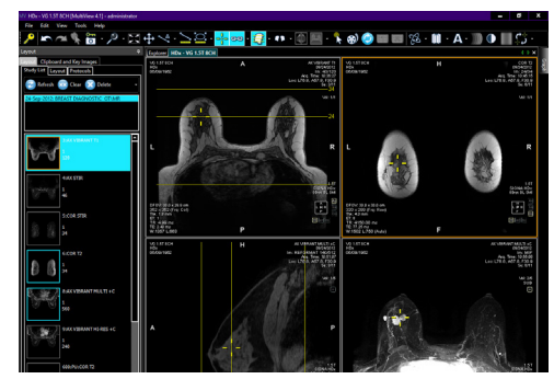
Figure 2. Spatial Locator